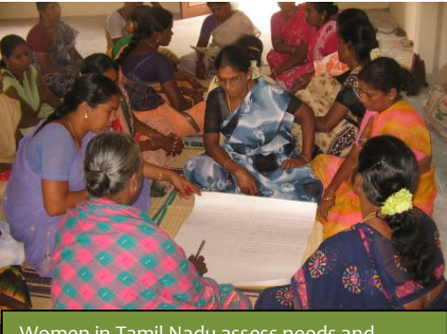
Women in Tamil Nadu assess needs and priorities of local communities

Hyogo Framework for Action 2005 – 2015: Building the Resilience of Nations and Communities to Disasters