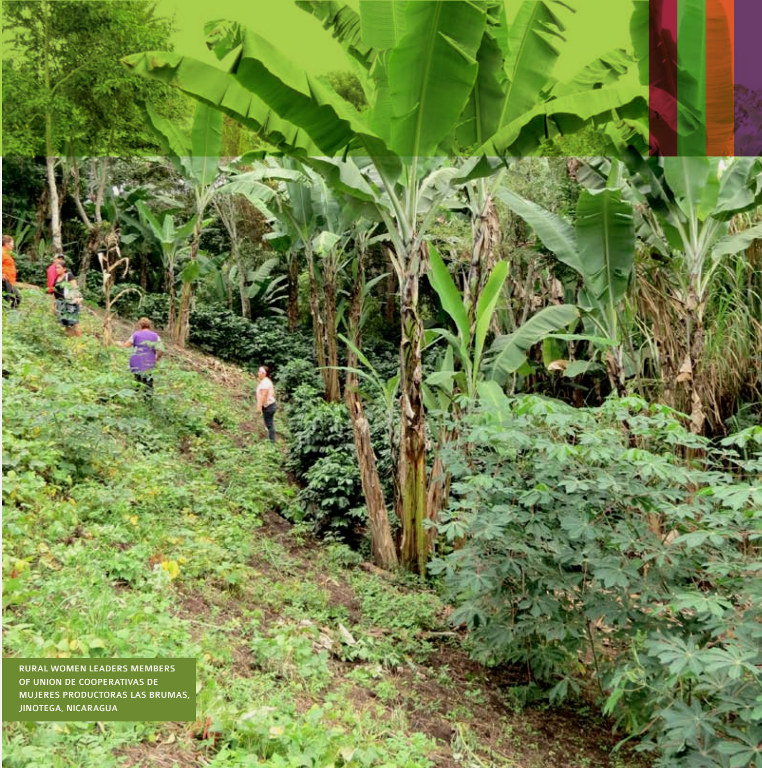
RURAL WOMEN LEADERS MEMBERS OF UNION DE COOPERATIVAS DE MUJERES PRODUCTORAS LAS BRUMAS, JINOTEGA, NICARAGUA