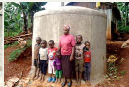
COMMUNITY RESILIENCE AT SCALE: GRASSROOTS WOMEN DEMONSTRATING SUCCESSFUL PRACTICES