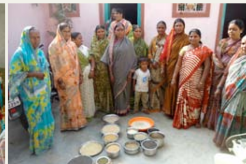
COMMUNITY RESILIENCE AT SCALE: GRASSROOTS WOMEN DEMONSTRATING SUCCESSFUL PRACTICES