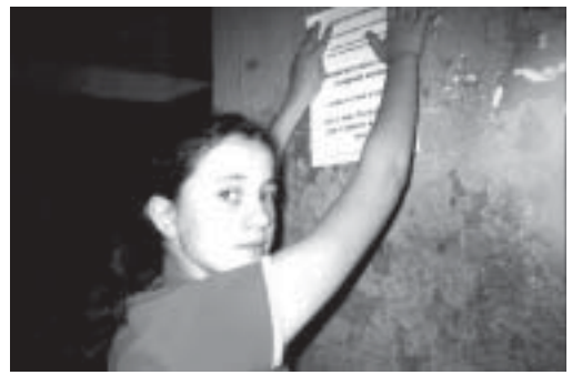
A Children's Board Member Hanging Signs Asking Residents to Help Remove Old Sand from a Playground.