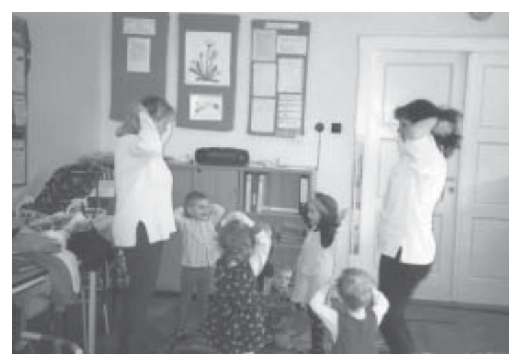
Mothers and children during one of the morning programmes.