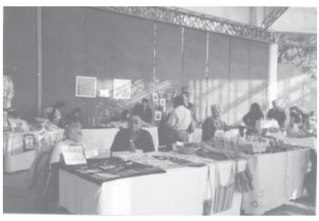
The Second Entrepreneur Meeting

The River Intercommunity Group presented the River Plan and Sustainable Local Development Plan at a meeting with primary and secondary school teachers.