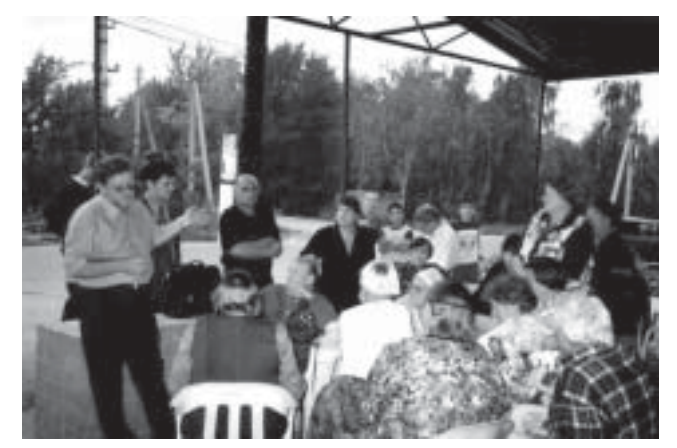
Grassroots women in Russia building alliances with local authorities through a grassroots-initiated meeting.

They make bureaucrats and elected officials accountable to communities/constituencies. The incentives built into state bureaucracies demand that officials be primarily concerned with managing macro policies and implementing directives from "above." While there may be demands from below, there are rarely any incentives to respond to these. Even where national policies have created a favourable environment for