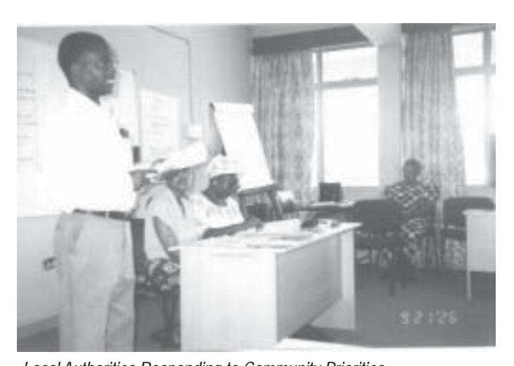
Local Authorities Responding to Community Priorities

MWG used the Local to Local Dialogue process to undertake research and prepare the documents required for acquiring legal status for their group. The group is currently negotiating with their local authorities and lawyers to ensure that their organization is