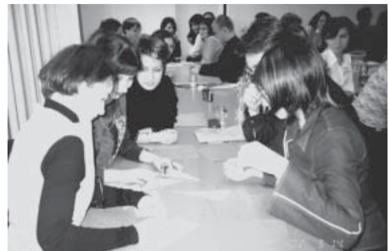
Grassroots women working together in Russia

While state mandated organizations have the official recognition of the government, women have to ensure that these organizations address their agendas. For women initiated collectives, it is quite the opposite. Being initiated by women, there is a strong sense of ownership and thus women set the agendas of the organization. It is to gain the legitimacy and recognition from the state that these collectives invariably have to struggle.