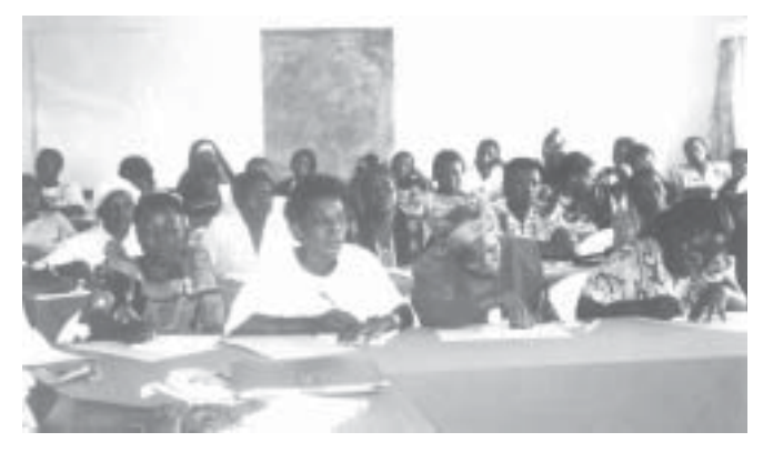
Women Listening and Taking Notes at the Workshop.

The roles of women within a society, usually assigned by men, often dictate the terms of women's participation within governance. Realizing this enables women to more aptly alter the structures of power as they work to engage in planning and decision-making processes.