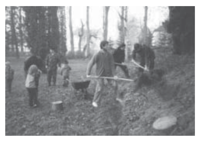
Between November and December 2002, the first steps in the actual construction of the children's playground were initiated.

The realisation of the project brought many complications and surprises caused by the changes in elected officials which disrupted the negotiation process. A new architect was appointed with whom the women did not have experience negotiating. As a result, their ability to participate in the design of the new playground was limited. However, 70,000 Czech Crowns from local authorities did further support the