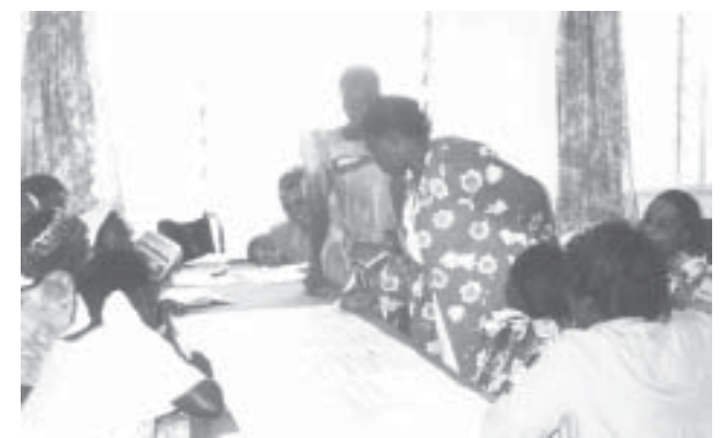
Identifying Area Priorities

All the groups decided to use the Mama FM, a women's radio station, to discuss the problems of adolescent sexual behaviour and violence against women.