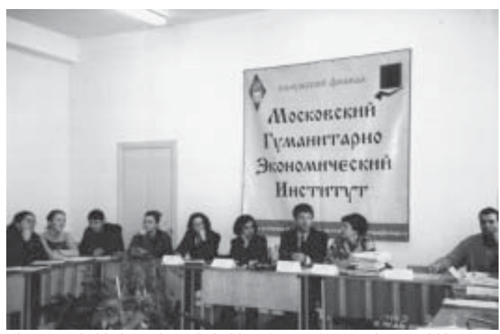
The Roundtable brought stakeholders face to face so they could learn from each other and explore ways in which to collaborate. These different actors expressed their need to share information, learn through community initiatives and transfer experiences and insights across communities.