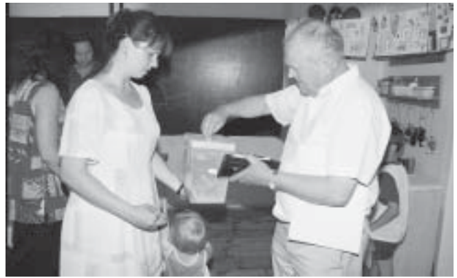
Mothers in the Czech Republic Raising Money for their Playground Project

In order to strengthen their position in any negotiation with authorities, increase their leverage and make the somewhat protracted dialogue process a worthwhile investment, women's groups need to build their capacities. Since much of their learning is through experience and practice rather than through instruction and classroom learning, it will rarely occur before or outside the negotiation process. Thus the dialogue process is itself the site of learning for one set of skills.