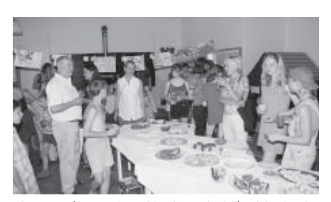
The Mayor (the man in a white shirt to the left) celebrating the Success of the Czech Republic Playground Project with Grassroots Women and their Families

In India, supported by Swayam Shikshan Prayog in Maharashtra, women's groups are involved in monitoring basic services in their villages. One example of their monitoring efforts have been visiting schools. They have been finding that schools are in a state of disrepair, or that teachers are absent. They find that girl children are dropping out. They use their observations to keep higher authorities informed, but they don't simply wait for the government to take action. Women's groups are constantly finding ways to ensure that children stay in school, they find resources to improve the school building and build toilets and they work together to ensure that the teachers get to class on time and are actually fulfilling their duties.