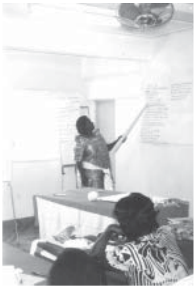
Guiding Women through Advocacy

Building coalitions and support for the advocacy issue is critical for the success of a project, because the more people that support the issue, the more pressure will be put on decision makers to take action. Talking with individuals and groups whenever the opportunity arises is a necessary first-step in this process.