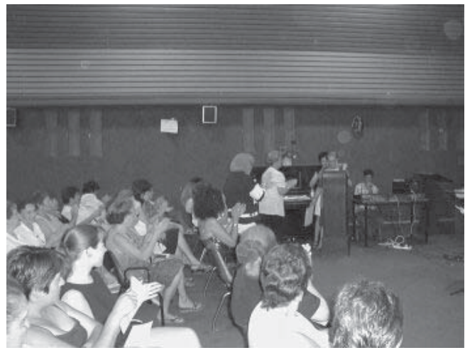
The Women's Day Workshop provided the starting point for these two groups of women to come together around issues impacting them and to find ways to collaborate.

The Family Community Market organised the Workshop on Women and Micro-enterprise to discuss how to link families, collective enterprise and women's role in families and communities.