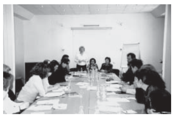
Community Planning Processes

The second meeting was held to monitor improvements in the settlement. No changes were observed. People hoped that the approaching elections would force authorities to address their problems. Their concern appeared in an article in the regional "Reporter" on 9August.