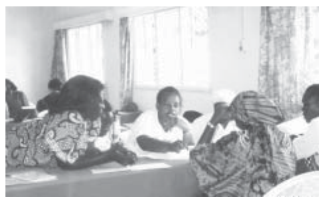
Planning for Community Surveys and Other Future Action

Analyzing the budget and then lobbying for resource allocations in areas that grassroots women consider important is one of the ways in which women can make local authorities accountable