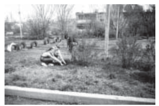
Children Planting Trees and Bushes in a Playground Area.

The Children's Board reviewed their work during the Festival. They decided to clean the playground and use it for dances and games. The next day, the children filled potholes and adults helped them use old tires to make football goals. 12 children played their first football match in the "new" playground.