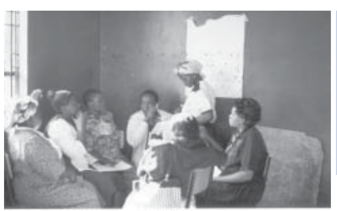
Women's Group Representatives Consulting One Another in Kenya

A key element of the mobilisation process is bringing collectives or communities together to discuss issues and reach a consensus on how to prioritise their actions. Civil society organizations, communities and women's groups have to invest in continually communicating among each other to agree on an agenda for advocacy and identify areas for collaboration.