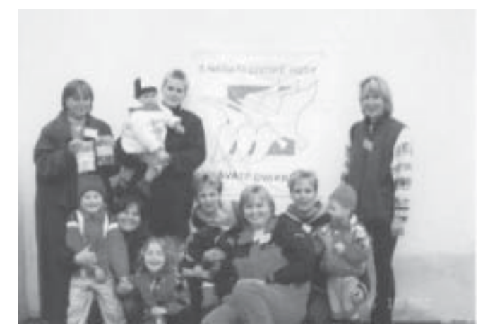
Castle Park March participants raising money for playground expenses.

The Mothers Center received a grant of 50,000 Czech Crowns from the VIA Foundation for the restoring of an old park located near the Mothers Center and the Senior Home. This project includes a children's playground, recreation areas for seniors and plenty of space for multigenerational meetings. The project continues to count on close collaboration with local authorities.