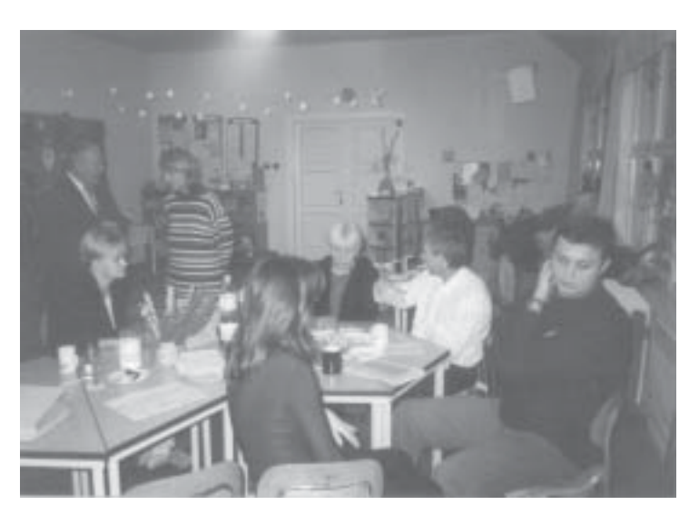
Mothers and local authorities working together in the context of the Joint Working Group.

The Breznice Mothers held their first meetings with the mayor and the town representatives, to present their proposals for building a safe modern children's playground with the support of the local authorities and mapping of suitable places for children playground. A Joint