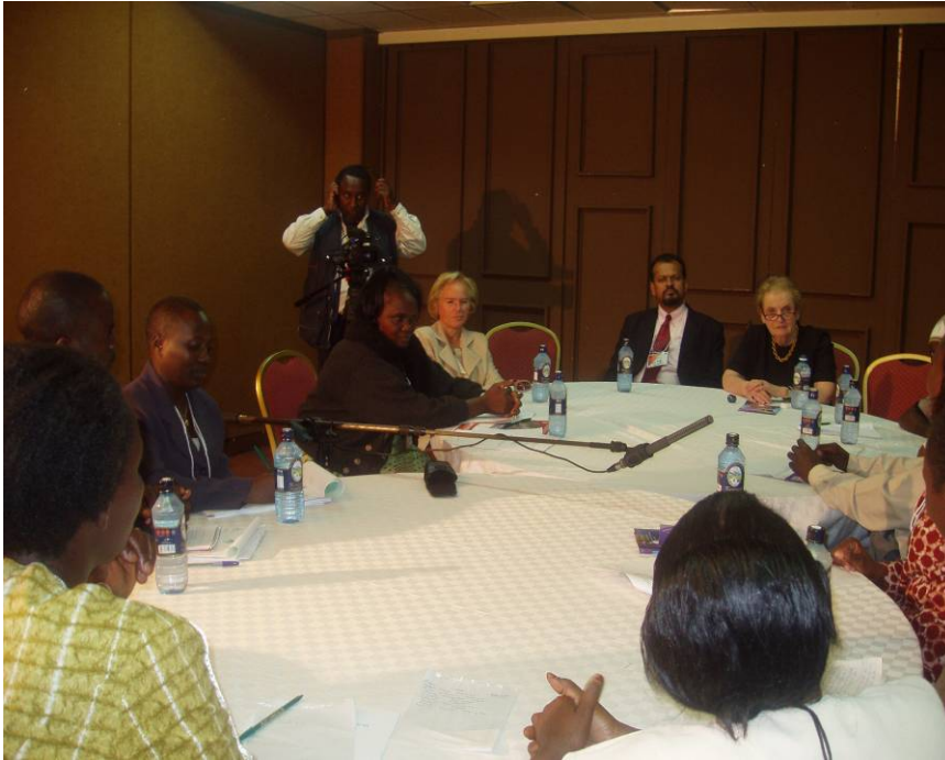
Madeleine Albright following presentation by grassroots women during aside meeting with GROOTS Kenya

Grassroots women reiterated that law is only law if there is an element of justice. Recommendation was given by grassroots women for current land policy to be implemented which has unique ideas that can address challenges like women land and property right. This will enhance social and economic mobility which will in turn improve the livelihood for poor people of whom majority are women.