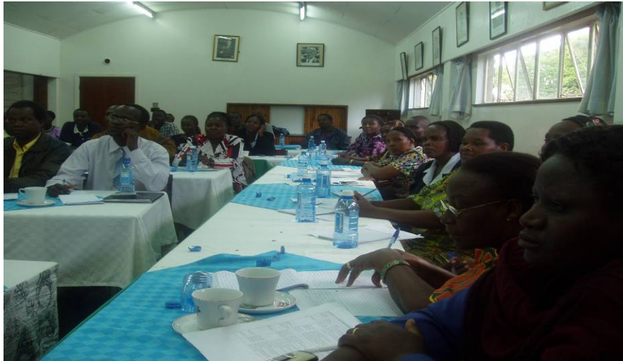
Participants following proceedings at the national meeting held at the YMCA- Nairobi

Reports from community consultation demonstrated a lot of similarities on emerging issues. The disproportionate burden on women as a result of HIV/AIDS and its consequences were very evident from the presentations. After all presentations, participants went into groups to harmonize and concretize priority areas. The following recommendations were given as consolidated voices from the national consultation meeting: