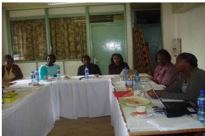
Selected representatives reviewing the recommendations of the national meeting and preparing for the national hearing

During this meeting the selected representatives with support of GROOTS Kenya secretariat reviewed recommendations agreed upon during the community consultation in the national meeting. They also had a chance to prepare a presentation on property rights which was presented during the national hearing on 28 th November 2006 at the Safari Park hotel.