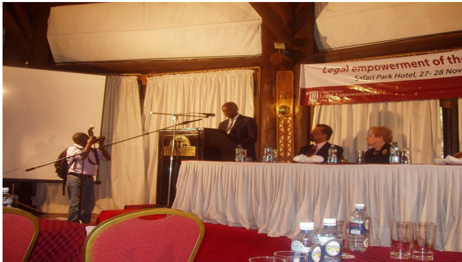
Prof. Kivutha Kibwana the acting Minister of land giving his speech to the commission on legal empowerment of the poor

The acting Minister of Land Prof. Kivutha Kibwana in his speech thanked the commission on legal empowerment of the poor for its effort to assist poor people around the world. He appreciated the efforts of various stakeholders across the country in providing recommendations to the commission which will improve the living standard of the poor people. As a government representative, Prof. Kivutha Kibwana advanced that the Kenyan government takes the work of the commission seriously and is committed to follow up its findings and recommendations to improve lives of Kenyans.