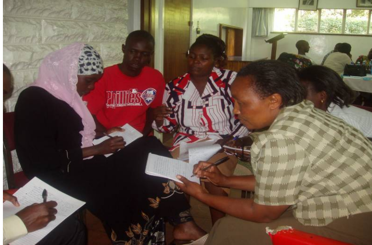
Participants in a group discussion on women and HIV/AIDS

After final recommendations were given as listed above, 8 representatives were selected and were tasked with the responsibility to review the document before submission and or presentation to the CLEP during the national hearing conference on 27 and 28 th November 2006.