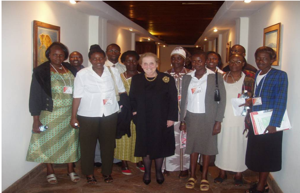
A group photo of Grassroots community members and Madeleine Albright after the meeting